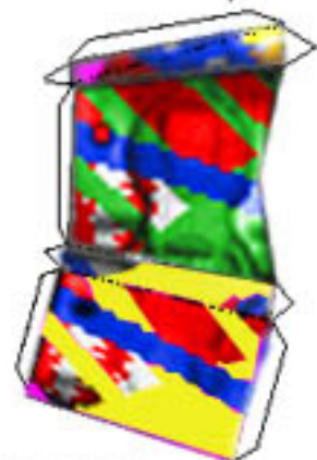
Starboard Pylon (right) Front-facing PBC