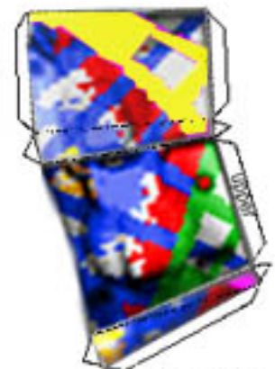
Port Pylon (left) Rear-facing PBC

Slide these over the internal cross brace supports after main assembly is complete